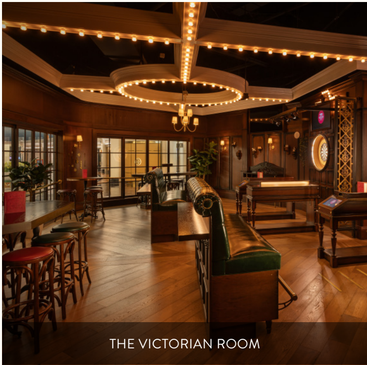
THE VICTORIAN ROOM