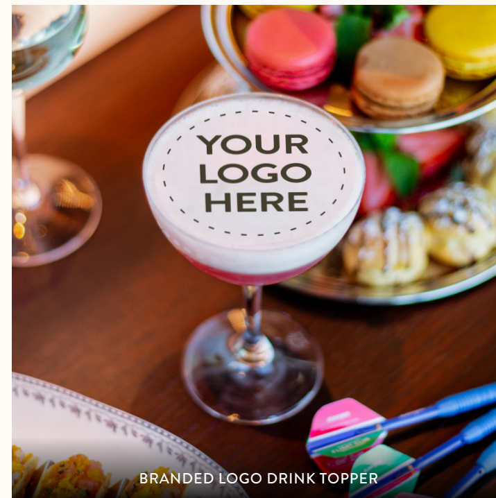
BRANDED LOGO DRINK TOPPER