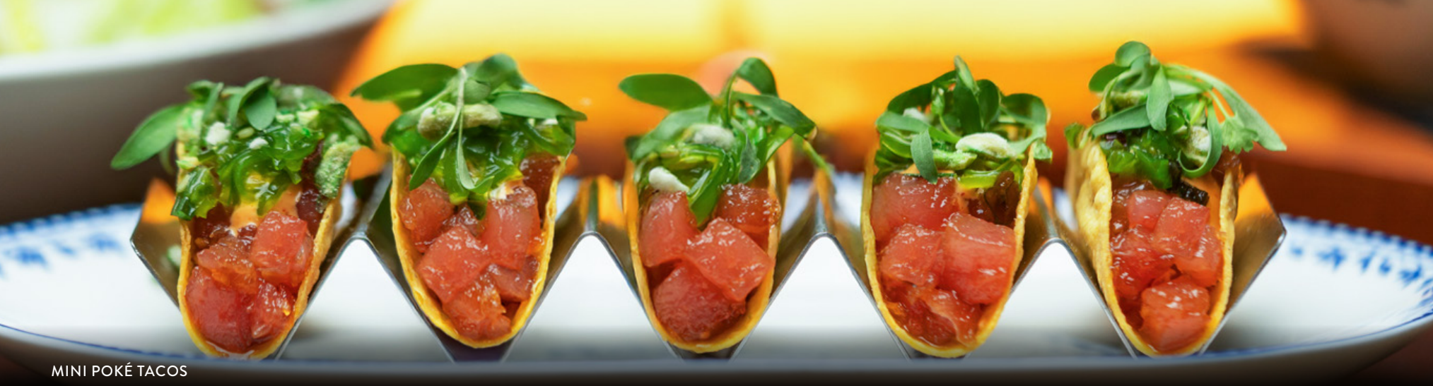
MINI POKÉ TACOS