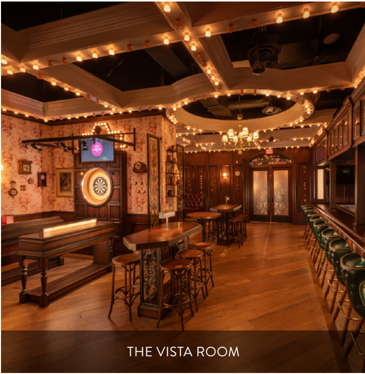
THE VISTA ROOM