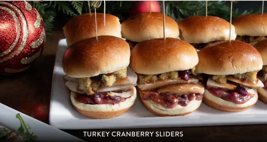
TURKEY CRANBERRY SLIDERS