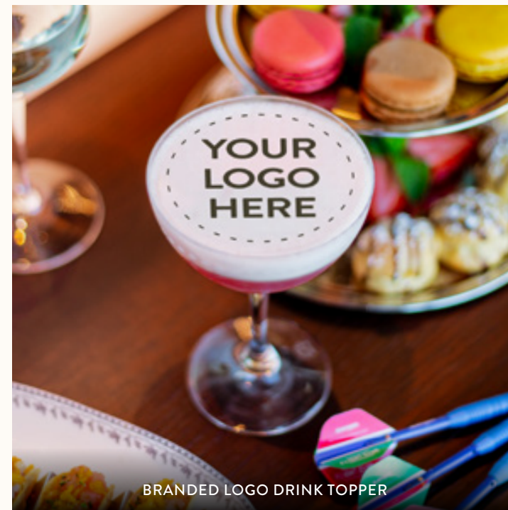
BRANDED LOGO DRINK TOPPER